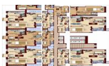
Block R Floor Plan