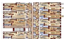
Block I Floor Plan