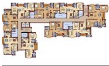
Block A Floor Plan