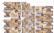
Block J Floor Plan