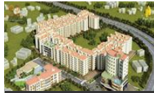
Bird Eyes View