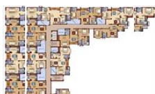
Block H Floor Plan