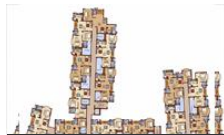
Block B Floor Plan