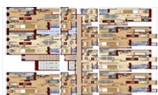
Block P Floor Plan