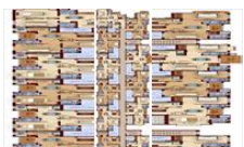
Block G Floor Plan