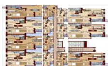
Block Q Floor Plan