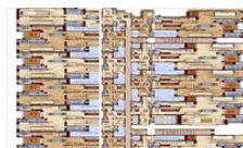
Block F Floor Plan