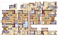
Block C Floor Plan