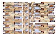
Block E Floor Plan