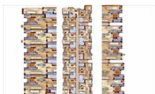
Block D Floor Plan