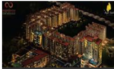
Night Time Bird