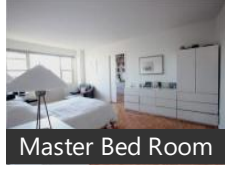
Master Bed Room