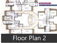
Floor Plan 2