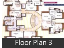
Floor Plan 3