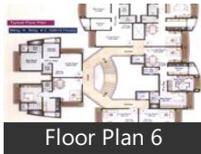
Floor Plan 6