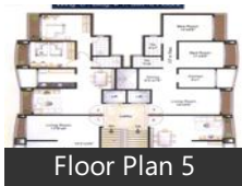
Floor Plan 5