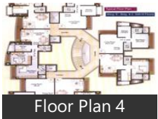
Floor Plan 4