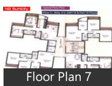
Floor Plan 7