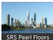
SRS Pearl Floors