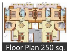
Floor Plan 250 sq.